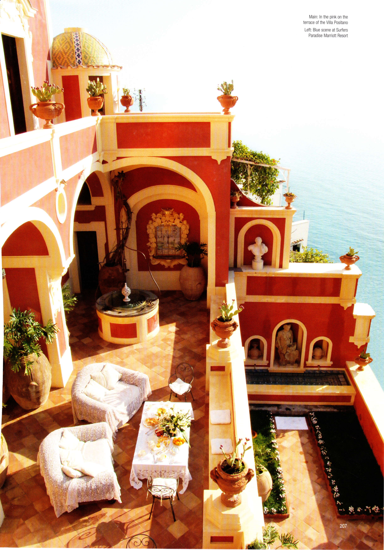
Main: In the pink on the terrace of the Villa Positano Left: Blue scene at Surfers Paradise Marriott Resort