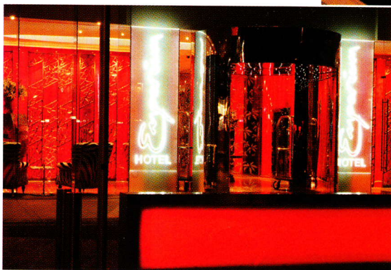
Above: In the red at Emporium