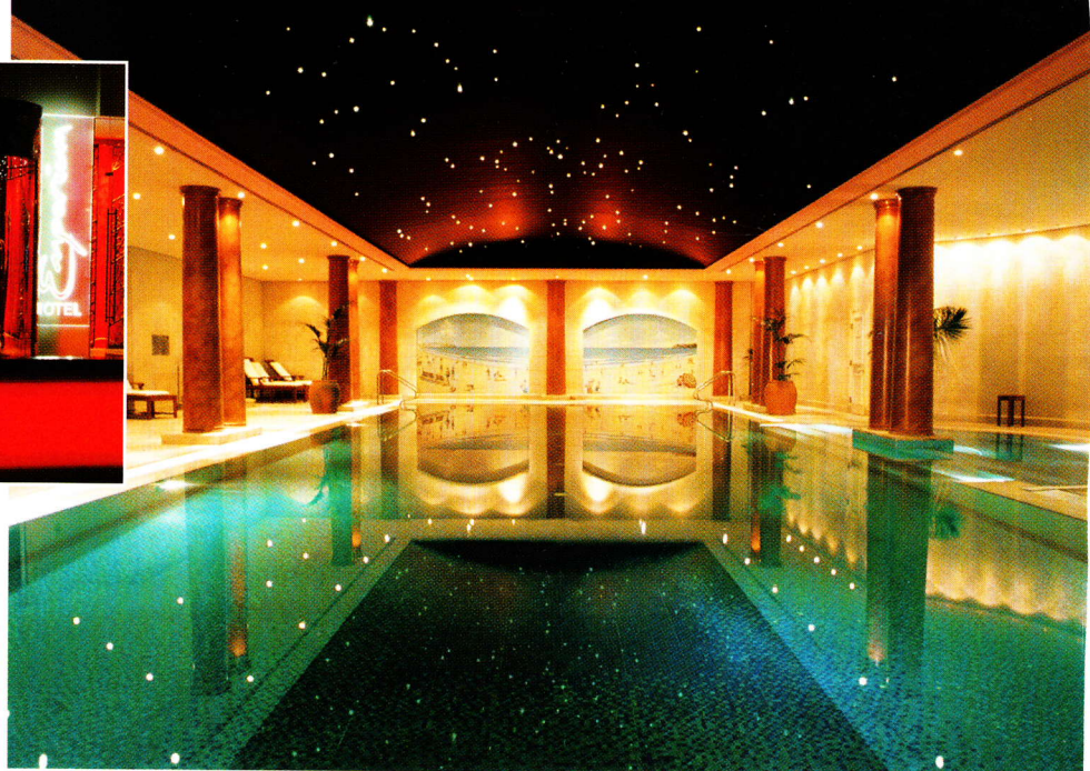
Below right: The spectacular setting of Southern Ocean Lodge

environs, the villas are furnished in contemporary southeast Asian style, with muted colour schemes accented by clever use of timber. Each is designed for indoor/outdoor living and has its own plunge pool. The resort's Italian restaurant, Sassi at Balé, gets great reviews.