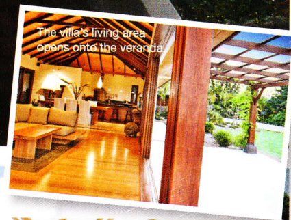
The villa's living area opens onto the veranda.

But don't think the other guests (or the hired help, if you're a movie star) do too badly: each of the bedrooms (there are four) are equally well-appointed with views over the manicured, tropical gardens and artful garden beds (the designer used to do Kerry Packer's gardens). There's even a conference and business office if you really have to take