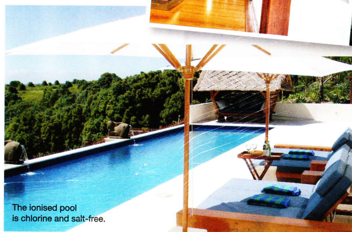
The ionised pool is chlorine and salt-free.

that meeting about your next film project or in case Harvey Weinstein calls.